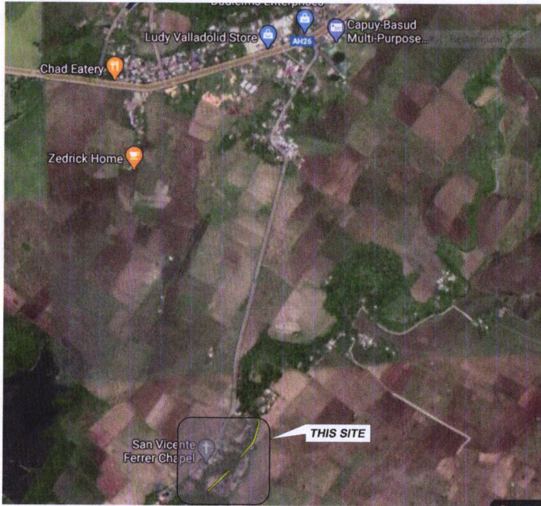
LOCATION PLAN NTS