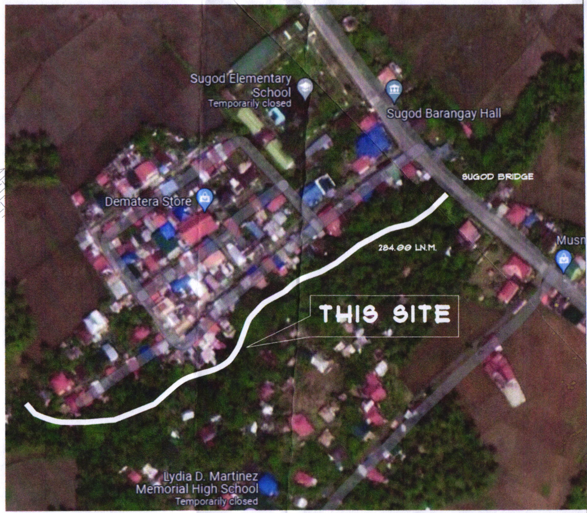
LOCATION PLAN NTS