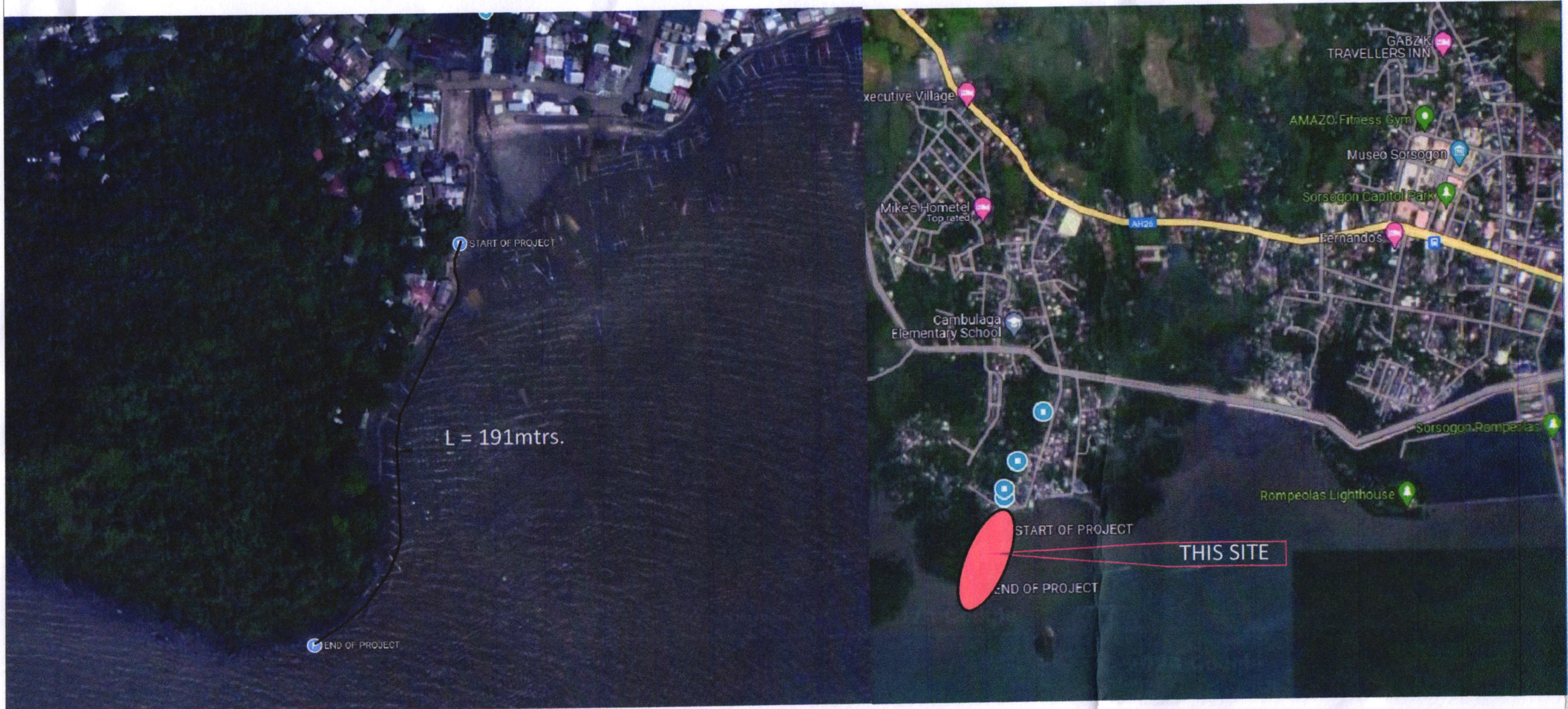
VICINITY MAP N T S